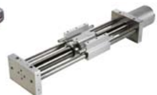
ROBO Cylinder Waterproof Type RCP2W-SA16C