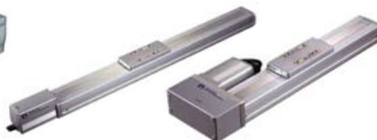
ROBO Cylinder High-Speed Type RCP2-HS8C / HS8R