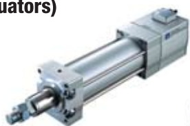
ROBO Cylinder High-Thrust Type RCP2-RA10C